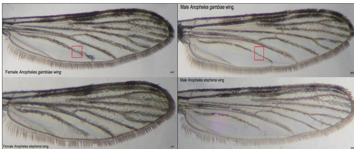
Fig 1: Images of Female and Male Mosquitoes (Diptera: Culicidae).

Such an App would be an invaluable aid to researchers in the field, for example where workers needed to identify different insect species from traps. It would also be an aid to anyone involved in the production of food and wishing to identify insect pests that may be attacking their crop. The applications are numerous and producing stock images of insects which are then uploaded into a 'World Wide Database' of insect images should become a primary aim in our digital age, where all known insect images uploaded can be made available to everyone for image recognition, as insects impact greatly on human health and food production. This is a realistic goal as entomologists and others working with or concerned with insects can be invited to upload ordered images onto this 'Global Database of Insect Images'.