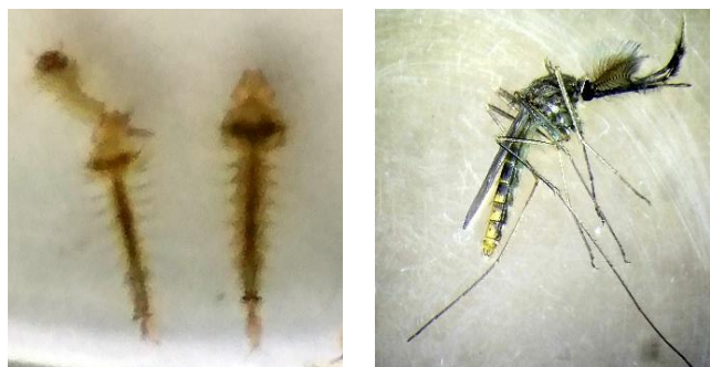
Fig 1: Lutzia tigripes larvae capturing the Culex larva (left) and adult male (right)

Larval stages of mosquito were collected from three breeding ground of Urembam, Imphal West during 13 th April and 21 st April, 2018. The immature larval stages were reared with appropriate foods in beakers till the emergence of adults and identification of the species was done from larvae, pupa and adults (female + male individuals). The identification keys followed in present studies included: Darsie [3] , Lane [8] , Bram [9] , Tanaka [5] , Hopkins [10] .