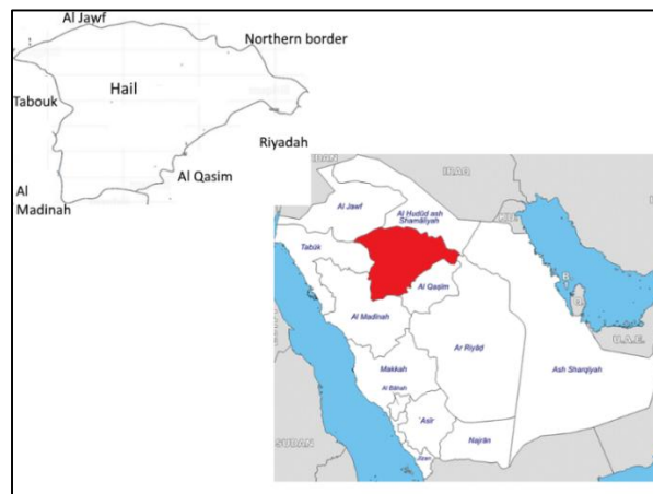
Fig 1: Location of Hail in the north-central part of KSA

42" 22' E and 34" 16' 25° to 16" 53' 28 N). It is bordered from north by Northern Border and El Jawf, from south by Al Madinah and Al Qasim, from east by Al Qassim and Riyadh and from west by Al Madinah and Tabouk. It has an area of 104000 km 2 (6.1% of the total Kingdom area) and a population of about 600,000 (2010 census). The region is subdivided into eight governorates (Baq'a'a, Al-Ghazalah, Ash-Shnan, Sumaira'a, Mawqaq, Ash-Shamli, Al-Sulaimi and Al-Hayet) in addition to the capital, Hail city and is characterized by two mountains: Aga and Salmi. Hail city (27°31'N 41°41'E) is located in an area of 825-1050 m above sea level and extends in the form of a bow surrounding Samraa mountain and it is bordered from north and west by Aga mountain which reach up to 1490 m above sea level. The city is famous for its agricultural products such as dates, fruits, vegetables, barley and wheat and acts as a passage for Muslim pilgrims from Iraq and Syria in their way to Makkah and Al Madinah. Hail has a continental desert climate with hot summers (average 29.6 °C) and cool winters (10.6 °C); with somewhat milder climate during spring (20.7 °C) and autumn (21.4 °C) than other Saudi cities due to its higher altitude. Seventeen localities were bimonthly surveyed for mosquito adults and larvae (Table 1) for one year from July 2015 to June 2016.