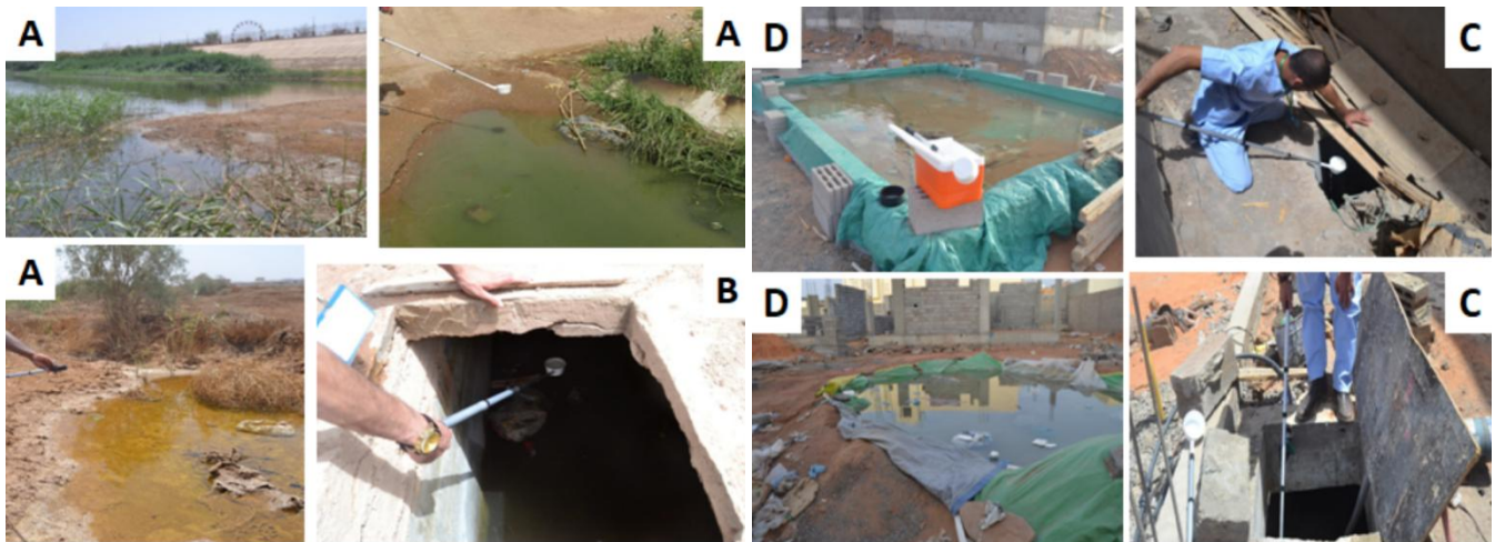
Fig 2: Examples of breeding sites A: seepage water, B: Septic tank, C: underground water reservoir, D: Surface water reservoir used for under construction buildings

temperature. The R's (Correlation coefficients) were 0.75 ( Cx. quinquefasciatus ) and 0.78 ( Cx. pipiens ).