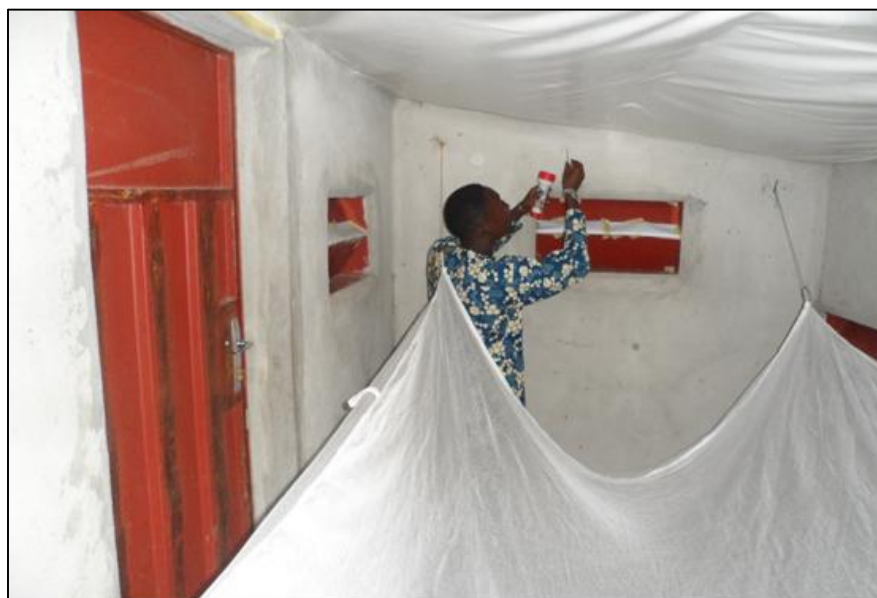
Fig 2: Mosquito collection in experimental huts