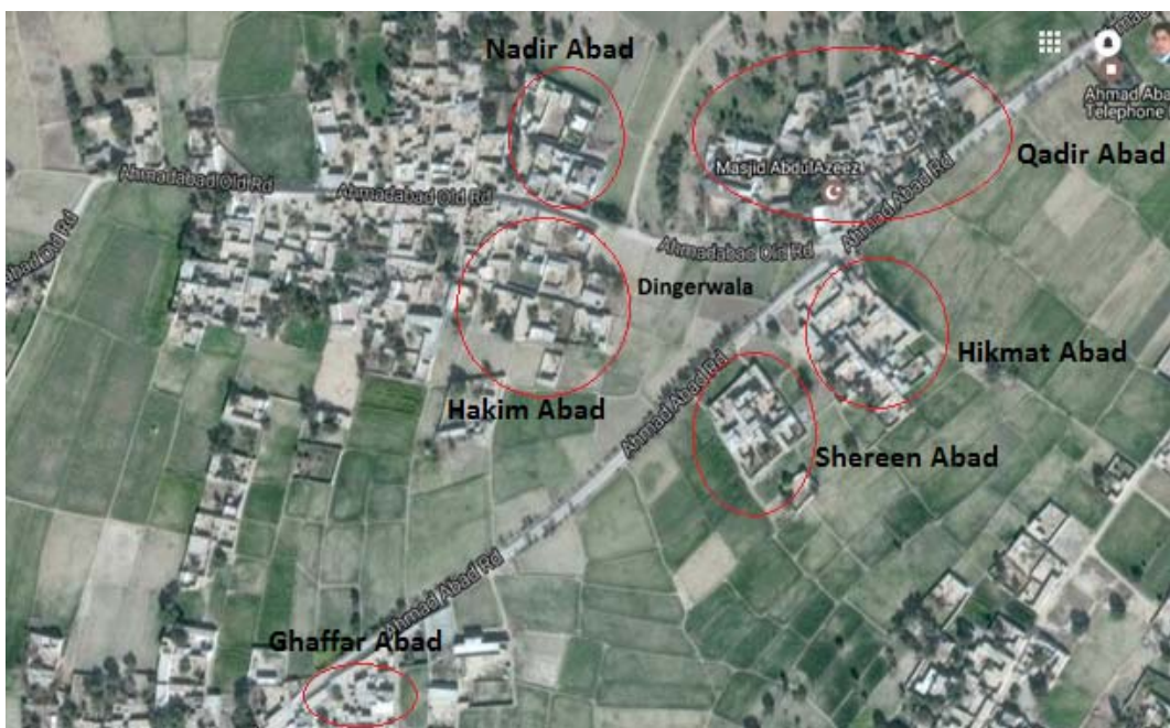
Fig 1: Map of Dinger showing sampling sites Khyber Pakhtunkhwa Pakistan.