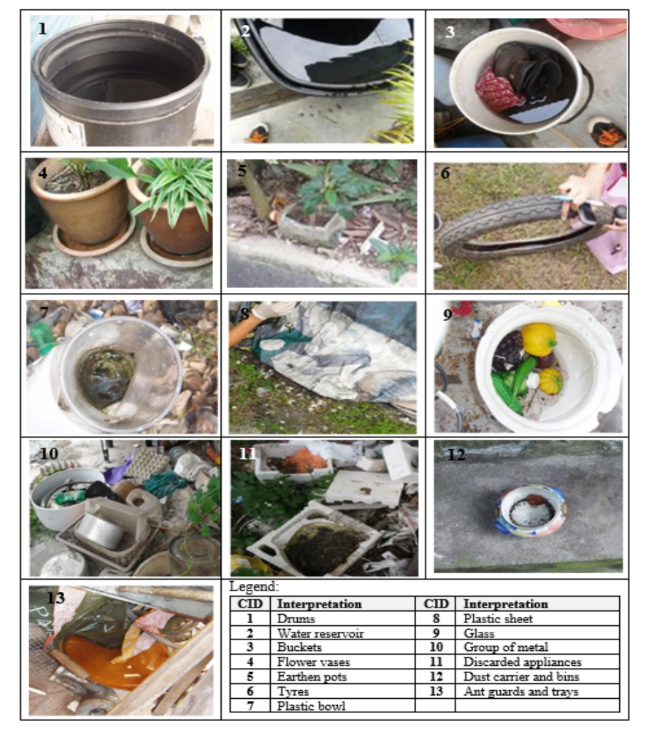
Fig 1: Categories of water-holding containers based on the CID

All water-holding containers were visually inspected for the presence of water with immature mosquitoes (pupae and larvae) (Figure 1). All the water-holding containers detected during the survey were counted and classified into 13 categories based on the container identity (CID). CID were given to the containers observed at the sampling sites were CID<sub>1</sub>: drums; CID<sub>2</sub>: water reservoir; CID<sub>3</sub>: buckets; CID<sub>4</sub>: flower vases and flower pots bases; CID<sub>5</sub>: earthen pots; CID<sub>6</sub>: Tires; CID<sub>7</sub>: Plastic bowls and pots, oil can, galloon jar and water bottled; CID<sub>8</sub>: plastic sheets, plastic water pools and bags; CID<sub>9</sub>: types of glass, which are unused aquarium, glass jars and ceramics; CID<sub>10</sub>: group of metal; CID<sub>11</sub>: discarded appliances, discarded foams, shoes, and helmets; CID<sub>12</sub>: dust carriers and bins, baby baskets and CID<sub>13</sub>: ant guards and trays.